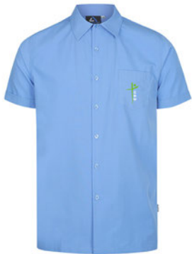
Short sleeve shirt